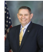
Sen. Cris Dush (R-Jefferson)