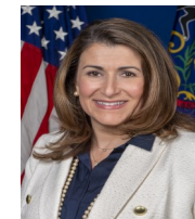
Sen. Rosemary M. Brown (R-Monroe)