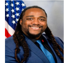
Rep. Ismail Smith-Wade-El (D-Lancaster)